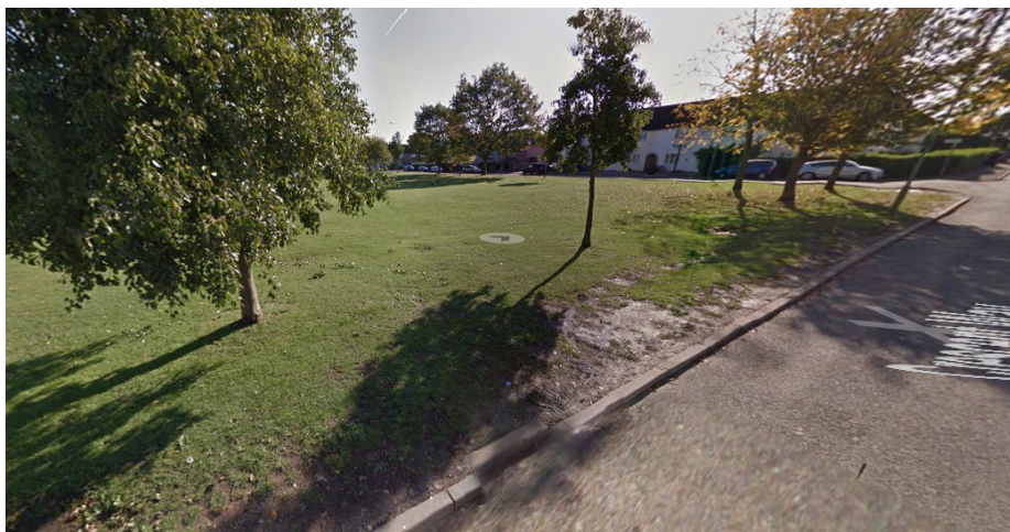
2015 Google Street View Imagery [Map data ©2016 Google]